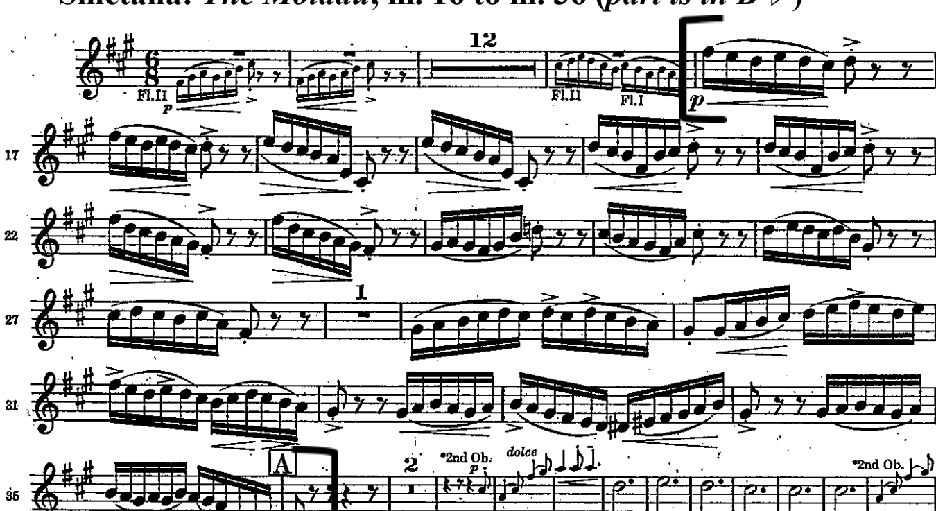
Smetana: The Moldau , m. 16 to m. 36 ( part is in B \flat )